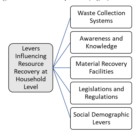
Figure 1: Key factors affecting home waste management Modified from Mwanza et al., 2018.

Despite these undeniable advantages, the level of citizens' participation and motivation to recycle are not always elevated. Gilli et al. (Gilli, Nicolli and Farinelli, 2018) show that the probability of recycling increases when people are motivated by the possibility of receiving an external reward for their action. Following this line, other authors (Schanes, Dobernig and Gözet, 2018) underline that households feel mainly guilty about wasting food when it is related to economic loss rather than environmental and social consequences. Results of Mwanza et al. (Mwanza, Mbohwa and Telukdarie, 2018) indicate that households are influenced in the recovery of waste by multiple levers, such as demographic factors, awareness and knowledge on recycling, waste collection systems (Fig. 1).