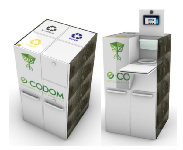
Fig. 4 – Conceptual draw of the smart waste compactor

Except for the steel-covered front part, all vertical sides of the compactor will be coated with a bioplastic (flax fibre mixed with a biocompatible resin) which has already been patented by a company from the project team. In the top surface of the device will be the inlet of three dry fractions (plastic, metal, paper). In the middle inner part of the device, the volume reduction of these three fractions will be obtained by means of crush rollers (i). In the lower part of the device, fractions will be stored into two steel waterproof removable drawers. This will allow the temporary collection of residual liquids inside the drawers without requiring the connection of the whole device to a drain network.